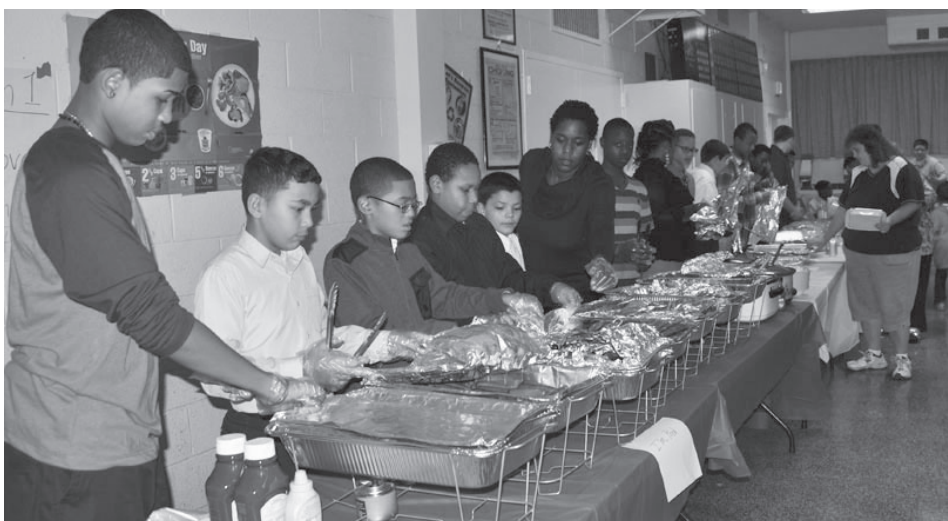
SACS Boys Modified Basketball Team members prepare to serve dinner to fans and supporters at inaugural fundraiser in October