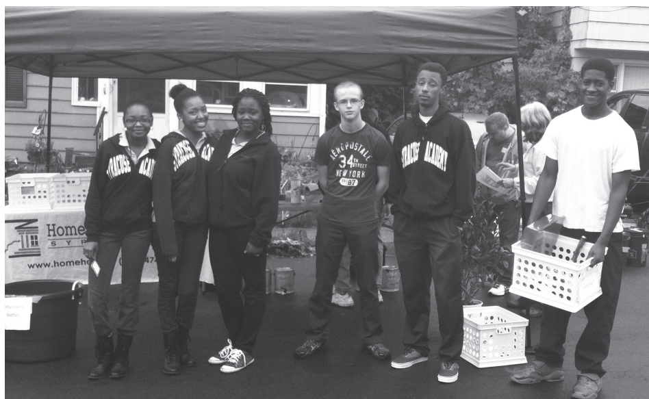
Students in Syracuse Academy's Peer Leadership Club participate in a Block Blitz sponsored by Home Headquarters in October.

YLP became a mainstay in Syracuse Academy's curriculum because of the school's belief in teamwork and community as well as the advantage to be gained from an adventure, experiential approach to learning.